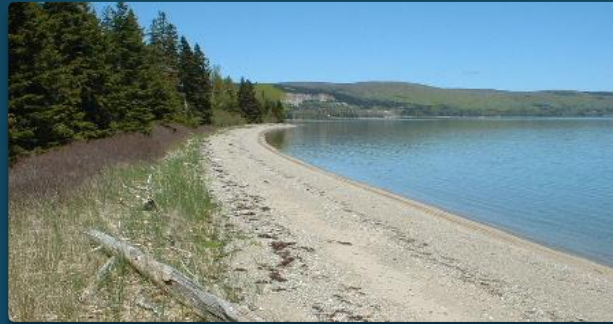
Sandy Beach at North Cow

The island is covered with dense hardwood, including spruce and fir trees