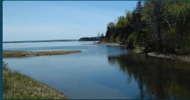
Inlet on South Calf