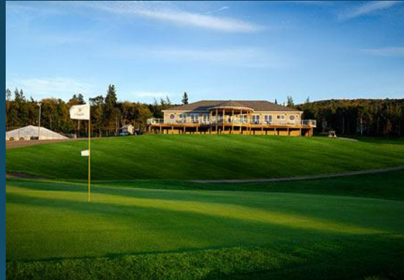
The Resort features a clubhouse, conference facilities and lodging.