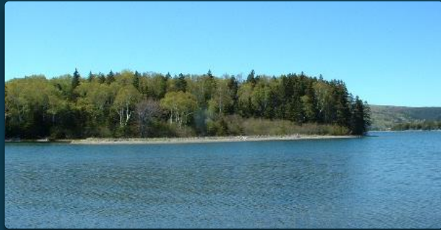
Beach on South Calf