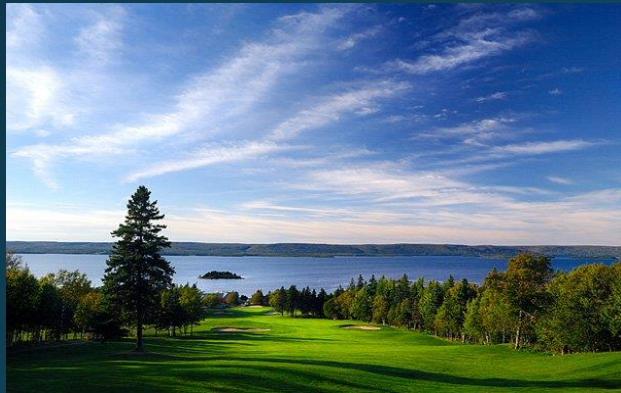
The 18-hole Golf Course features sweeping views of the Bras D'Or Lake

The Cow and Calf Islands are located within 11 km (by water) of the championship Dundee Golf Club and Resort