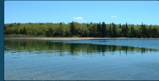
Sandy Beach at South Cow

The island is covered with dense hardwood, including spruce and fir trees