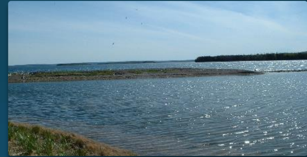
View from South Calf